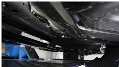
6. Once everything is aligned properly proceed to tighten down the nuts & bolts. Double check both driver & passenger side.