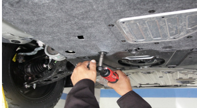
3. Remove any covers blocking side step entries.

1. Separate all hardware and get ready for install. If anything is missing or damaged please do not proceed & contact us immediately.