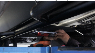
5. Continue to loosely attach side steps with the hardware provided.(ENSURE SIDE STEPS ARE ON THE CORRECT SIDE)